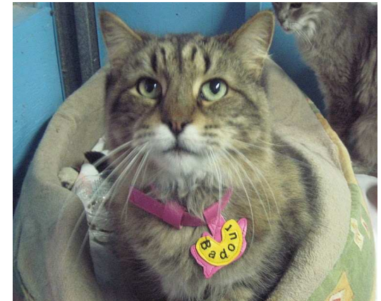
Badour, waiting to be sponsored

Animal Rescue Network Montreal's largest no-kill shelter for cats