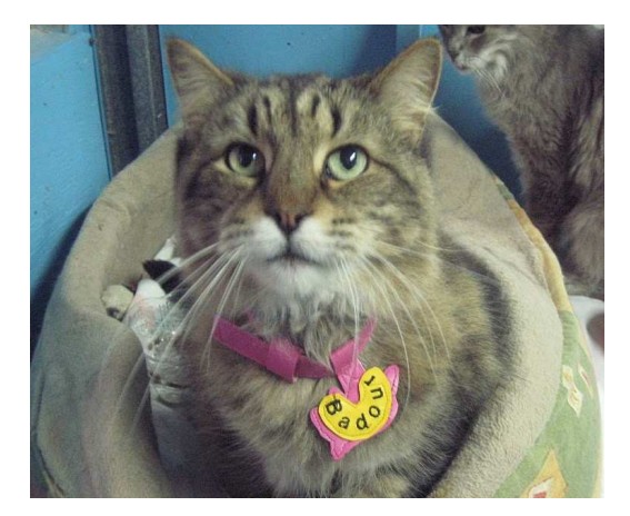
Badour, waiting to be sponsored

Animal Rescue Network Montreal's largest no-kill shelter for cats